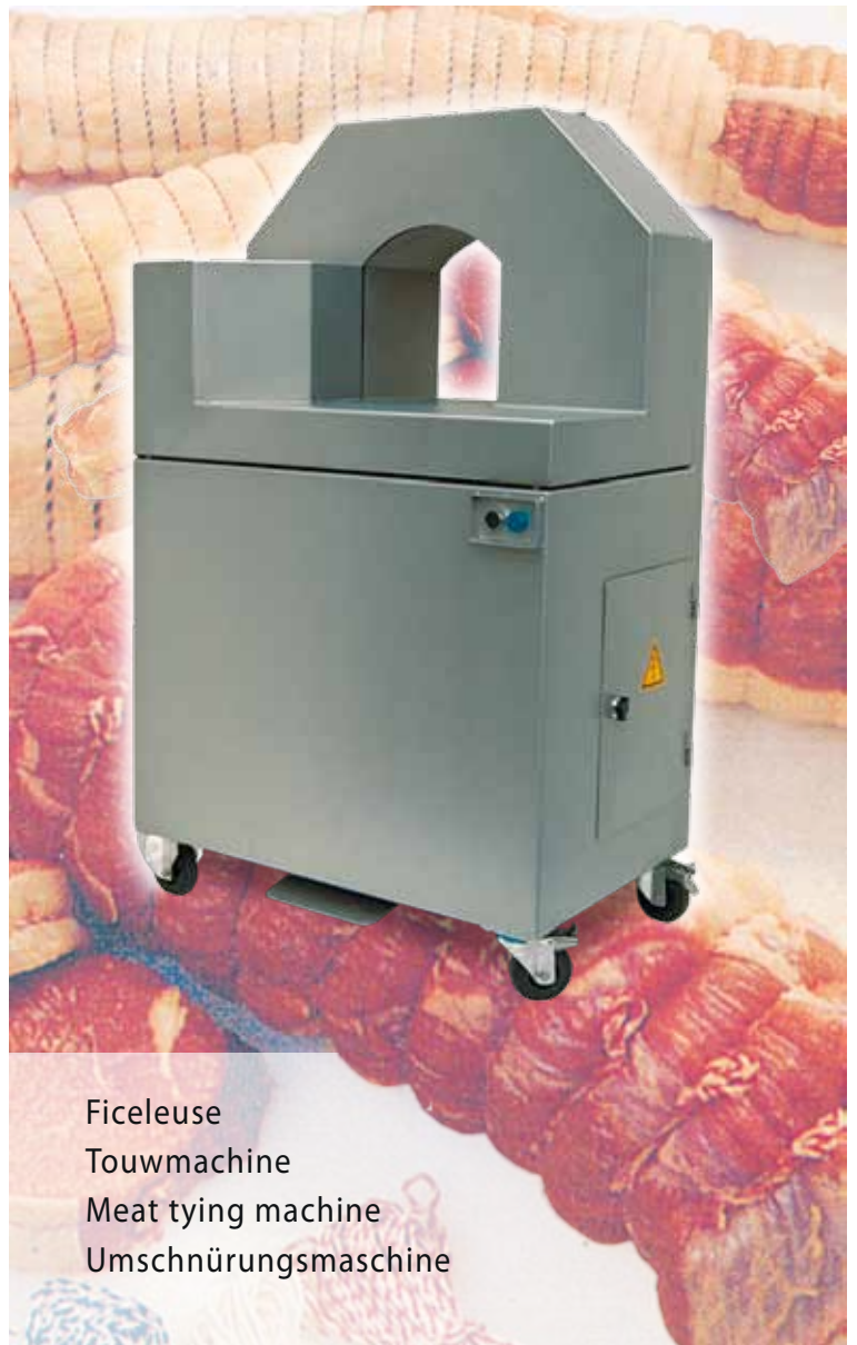
Ficeleuse Touwmachine Meat tying machine Umschnürungsmaschine